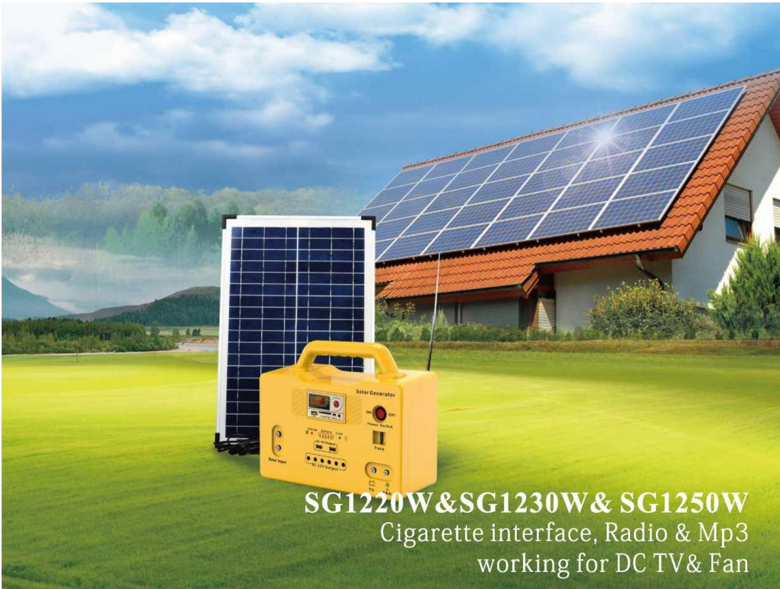
SG1220W & SG1230W & SG1250W Cigarette interface, Radio & Mp3 working for DC TV & Fan