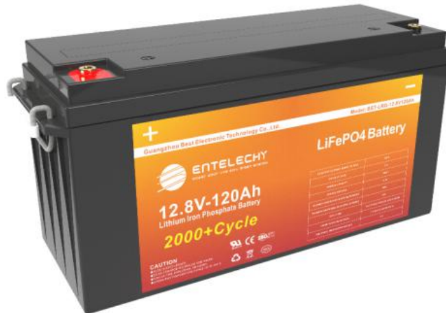
12V120Ah Battery outside picture ( Picture only for you reference,result depends on production )

4.3.1 Battery bag outside picture (483*170*240mm without handle; tolerance class: GB/T1804-M)