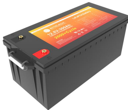
12V300Ah Battery outside picture ( Picture only for you reference,result depends on production )